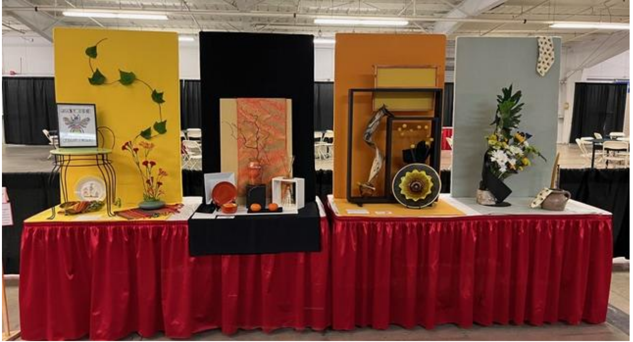
VT Flower Show 2023

Pictures are representative of flower shows, provided by the Vermont Judges Council