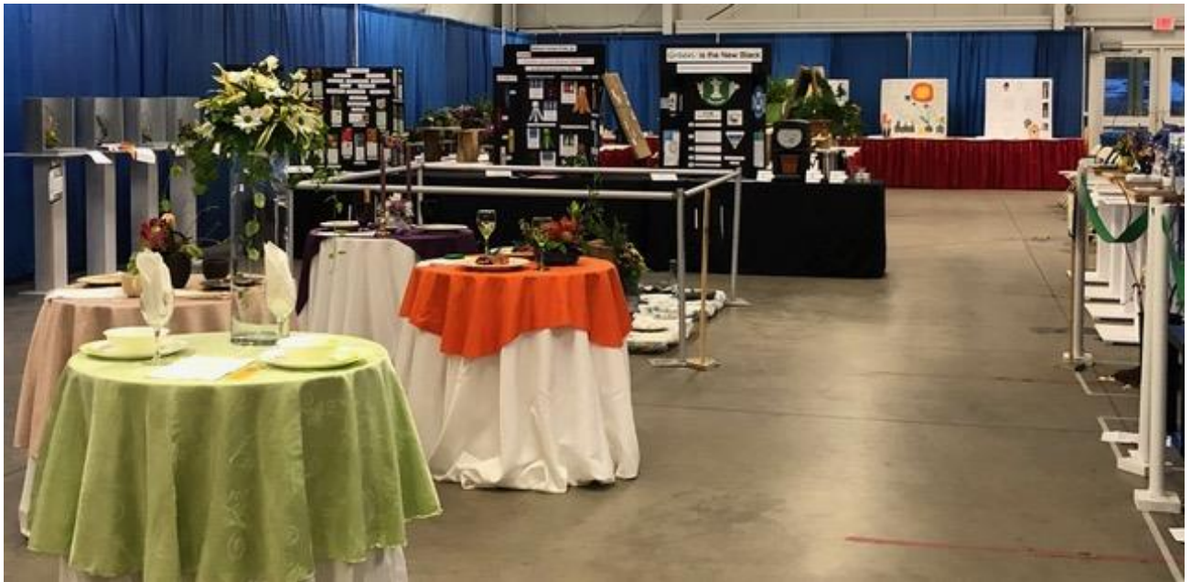
VT Flower Show 2019

Pictures are representative of flower shows, provided by the Vermont Judges Council